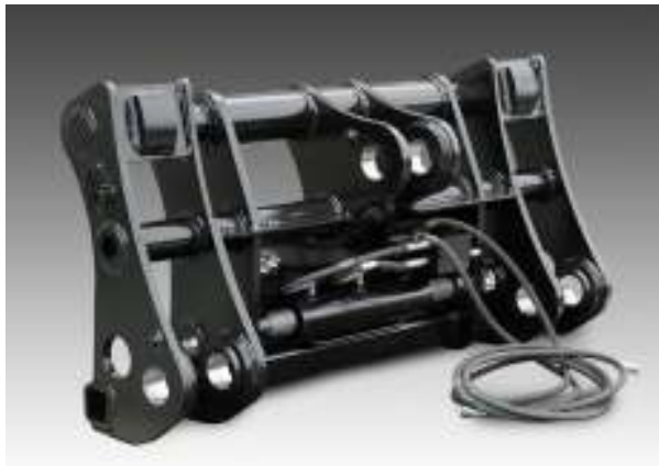
Class 2, 3, 5, & 6 CF Loader Coupler